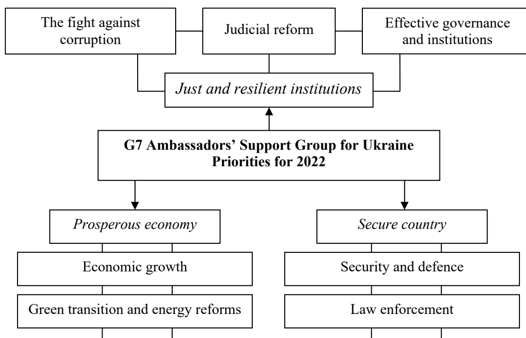
Figure 2. Priorities of the support group for Ukraine in moving forward

Ambassadors in Kyiv to encourage and support the Government and citizens of Ukraine on their way towards a more secure, prosperous and resilient country. In 2022, the ambassadors of the G7 countries in Kyiv presented the priorities for this year. They will continue to encourage Ukraine to reform security and defense, taking into account the views of the government, parliament, civil society and business. The G7 ambassadors identified three groups of priorities in which they will work: fair and sustainable institutions, a prosperous economy and a secure country ( Figure 2 ) [17].